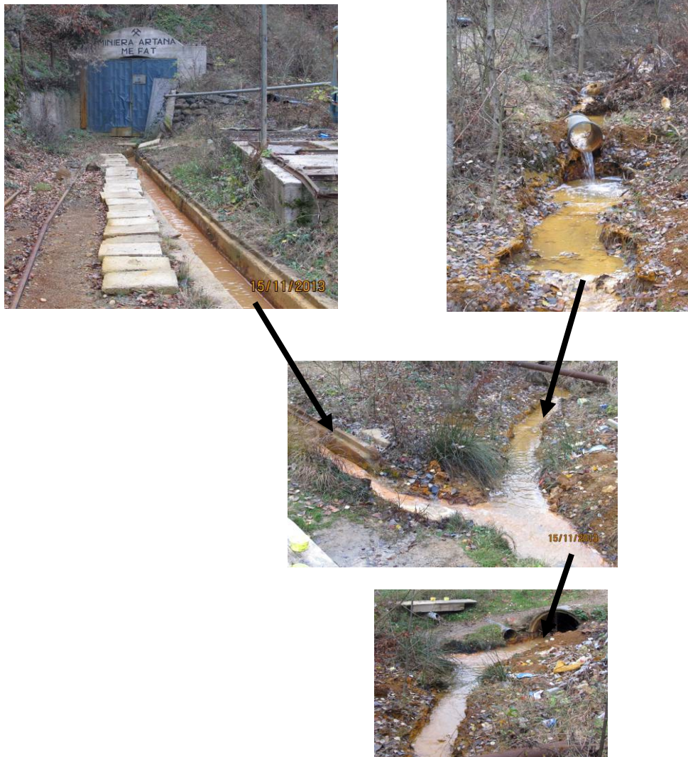
Figure 2 Outflows and open creeks with acid mine waters