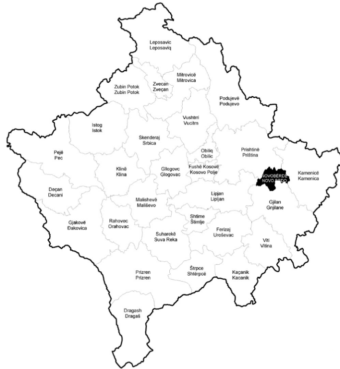
Figure 1 Borderline KOSOVO and location of the municipality of Novo Brdo (Helvetas 2012)

The relief in the area surrounding the mine complex is quite steep. The mine is located in a mountainous area under the highest peak with an altitude of 1,250 m a.s.l. The mine is situated in close vicinity to a valley, which leads to the Krivareka River valley. The highest elevation has adit V of the mine at 805 m a.s.l. The lowest point in the project area is the Krivareka River with an elevation of 664 m a.s.l.