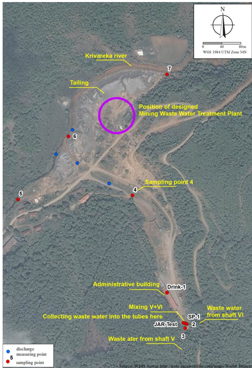
Figure 4 Sampling and flow measurement locations

Figure 4 shows the mining area with the sites for water sampling (red dots) and flow measurement (blue dots).